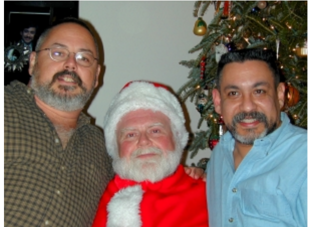
Our party hosts get a chance to sit on Santa's lap