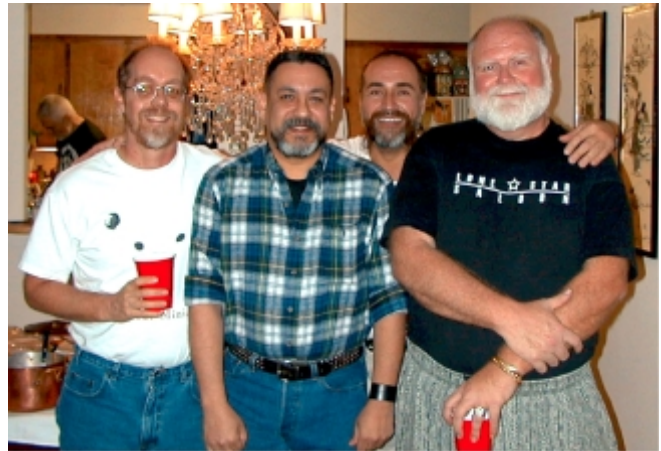
HOT Bears President, VP, Secretary, and Treasurer