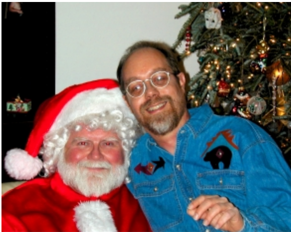
Our President asks Santa to bring lots of bears for Christmas