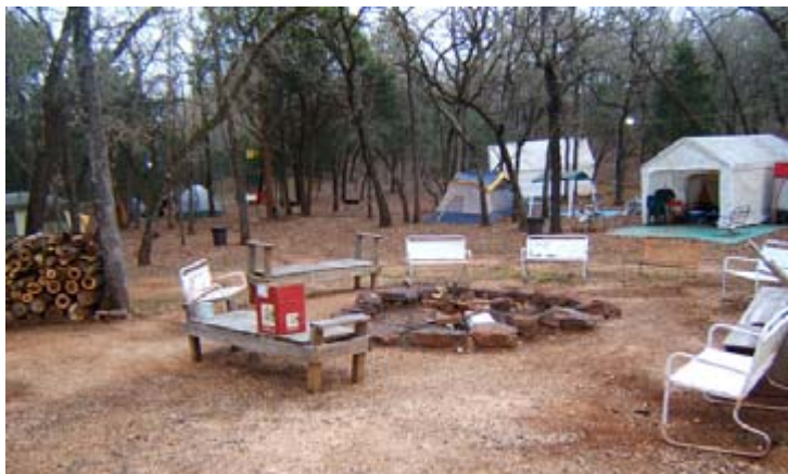
In the evenings, this fire pit is a gathering place.

a professional kitchen, a Pole Barn (for performances), and a sound system. The campground also has hiking trails and gathering places for meditation and celebrations. In addition to its increasing use by the member clubs, TCC now offers the use of the land site to interested community groups for their recreational functions.